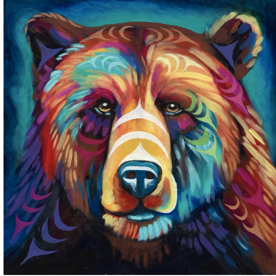
FIGURE 3. Cover Art "Sacred Paint: Ethereal Passage"