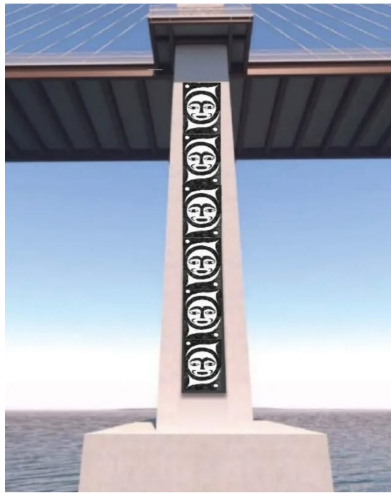
FIGURE 5. "The Hunter's Moon"

Figure 5 "The Hunter's Moon" is a conceptual design by Gabriel and others at Octopus Spirit Enterprises, which recently won the bid to be installed on the massive Patullo Bridge Replacement Project. The design will be constructed using embossed concrete and illuminated at night. It will be 35 feet tall and 5 feet wide. It will have a monumental impact on the new bridge infrastructure and will be visible to millions of people in the Lower Mainland and around the world. When sharing the successful bid, the artist told followers, "Our design, The Hunter's Moon , tells the ancient story of the annual Autumn salmon harvest on Kwantlen's River (the Fraser River). A celestial lunar event important in Coast Salish cosmology" (Gabriel,n.d-c)