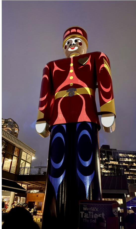
FIGURE 4. "World's Largest Coast Salish Welcome Figure"